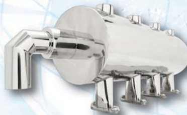
MINE-X ® Catalytic Muffler