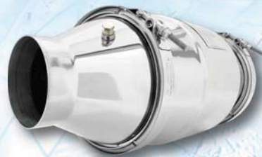
MINE-X ® Catalytic Converter